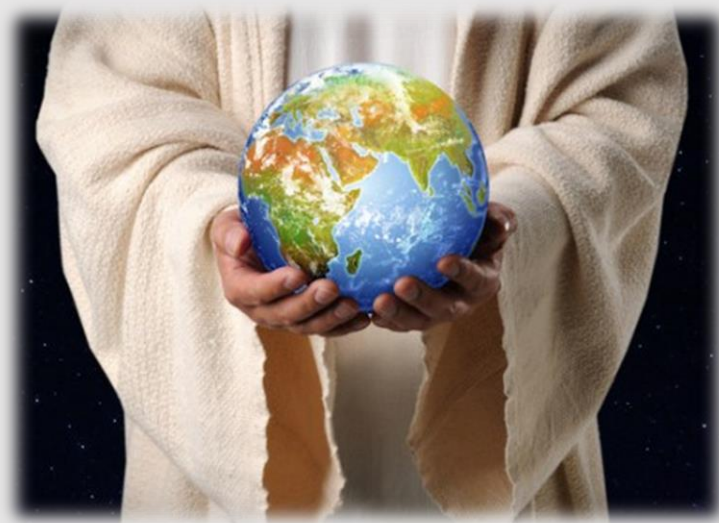
He holds the whole world in His hands